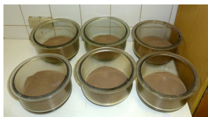
Fig. 1. Soil samples

Soil was divided into 1 kg samples and stored in special containers of similar size and geometry (Fig. 1).