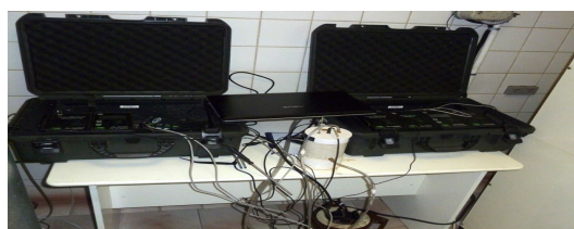
Fig. 3. Q-Box SR1LP

Since side products of bioremediation consuming hydrocarbons are water and carbon dioxide it is necessary to measure CO 2 emissions for comparison. CO 2 was measured with Q-Box SR1LP (see Fig. 3).