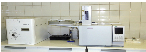
Fig. 2. Shimadzu 2010+gas chromatograph

Physicochemical characteristics of soil samples were also determined. Every week humidity of soil was measured to make sure 20% of field capacity is maintained, pH is kept at 5.5–6.5 level, soil temperature is constant (temperature determines the activity of microorganisms). TPH (total petroleum hydrocarbon) amount was determined by gas chromatography using Shimadzu 2010+ gas chromatograph (Fig. 2). In parallel, CO 2 emissions from soil were measured with Q-Box SR1LP (Fig. 3).